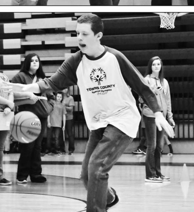
Special\ Olympics\ in\ full\ swing\ last\ Thursday\ at\ the\ UCHS\ gymnasium.\ Photos\ by\ Todd\ Forrest